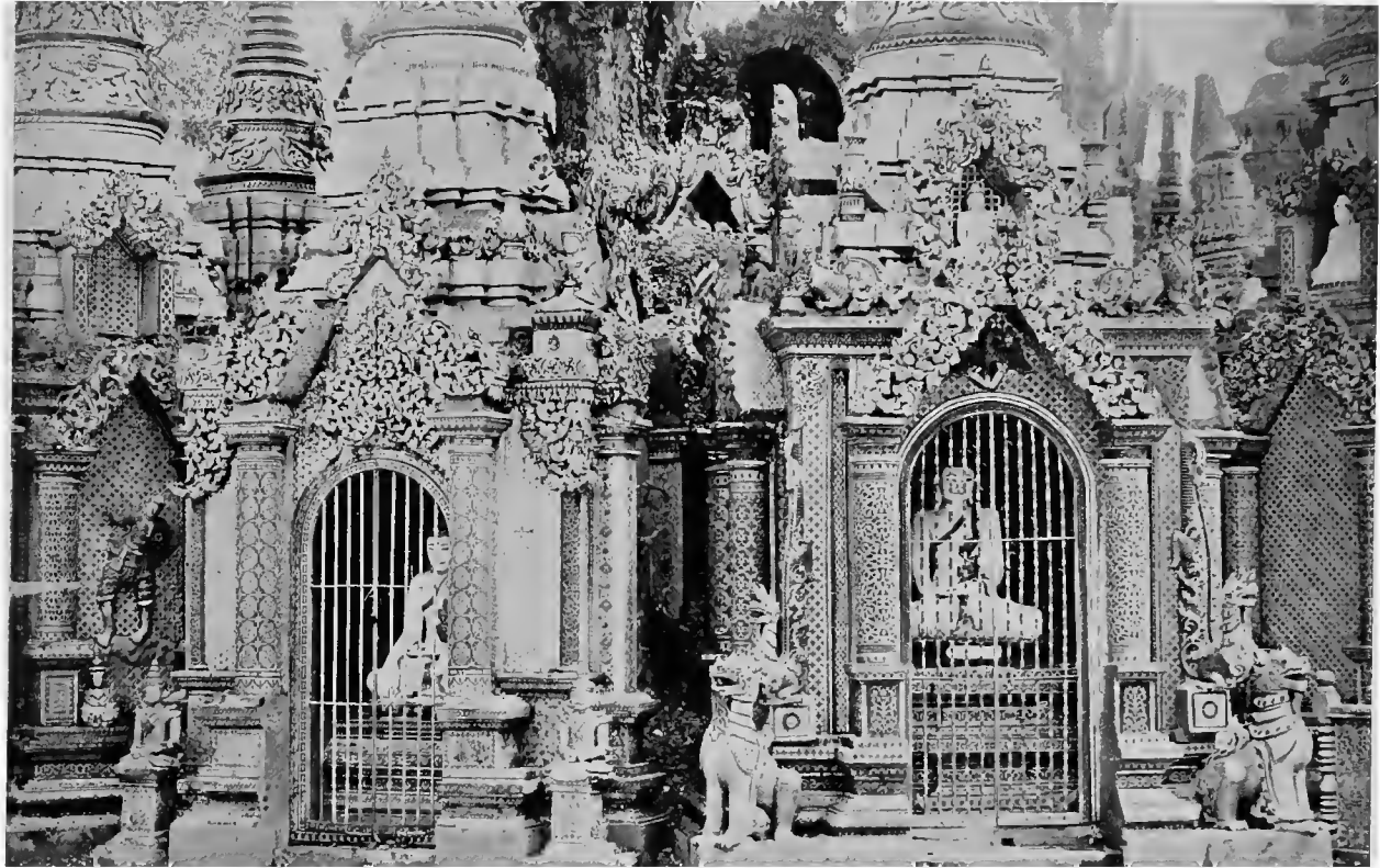
Burmese Carving at the Shwe Dagon Pagoda, Rangoon